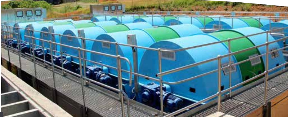
ABOVE Plastic media bio-filtration tank LEFT HYBACS installation at Tsakane